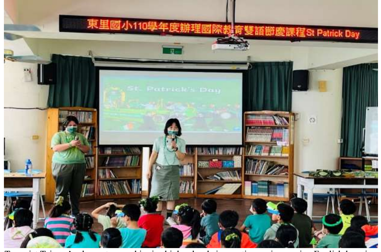
To assist Taiwan's elementary and junior high schools in creating an immersive English learning environment, the K-12 Education Administration, Ministry of Education, has worked with the Foundation for Scholarly Exchange, Fulbright Taiwan, since the school year of 2021 to implement the U.S. English Teaching Fellow Scholarship Program (the "ETF Program") and has recruited 57 U.S. English teaching assistants to engage in collaborative English teaching at elementary and junior high schools. In addition to assisting teachers in creating an English speaking environment in the classroom, ETF teaching assistants encourage students to speak English through club activities, team sports, reading activities, and camps, to integrate English communication into their daily life at school.

Take Hualien County Dongli Elementary School as an example, the ETF teaching assistants held St. Patrick's Day to expose students to this Irish festival through games and prompt them to speak English naturally through interaction in the games. Furthermore, to create an unforgettable English learning experience to schoolchildren in remote areas, ETF teaching